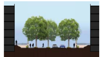
Neighborhood Street Section